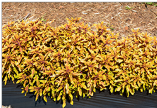
Hipsters Zooey Coleus