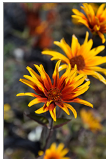
Burning Hearts False Sunflower flowers

Burning Hearts False Sunflower is an herbaceous perennial with an upright spreading habit of growth. Its medium texture blends into the garden, but can always be balanced by a couple of finer or coarser plants for an effective composition.