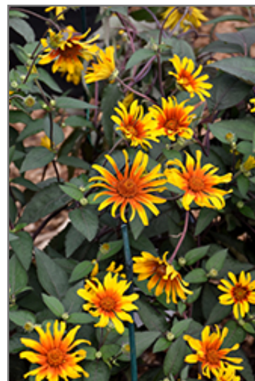
Burning Hearts False Sunflower flowers