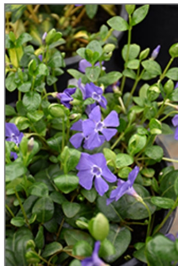
Bowles Cunningham Periwinkle flowers