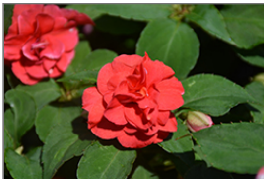
Rockapulco Red Impatiens flowers

Rockapulco Red Impatiens is recommended for the following landscape applications;