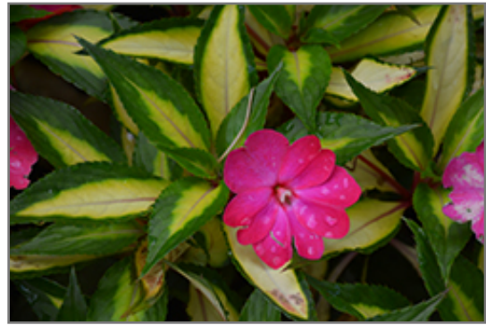
SunPatiens Compact Tropical Rose New Guinea Impatiens flowers