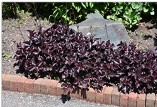
Obsidian Coral Bells