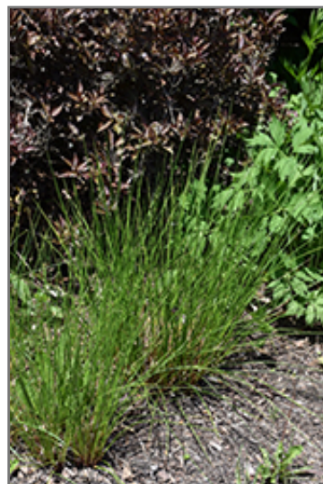
Common Rush