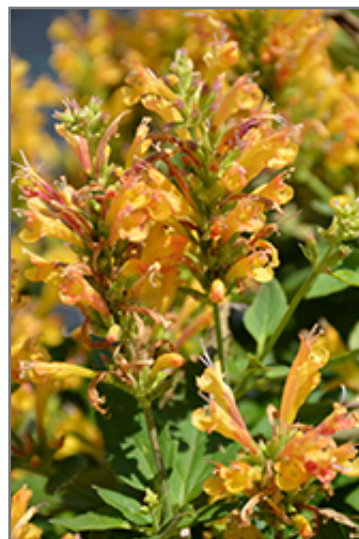
Poquito Butter Yellow Hyssop flowers

Poquito Butter Yellow Hyssop is recommended for the following landscape applications;