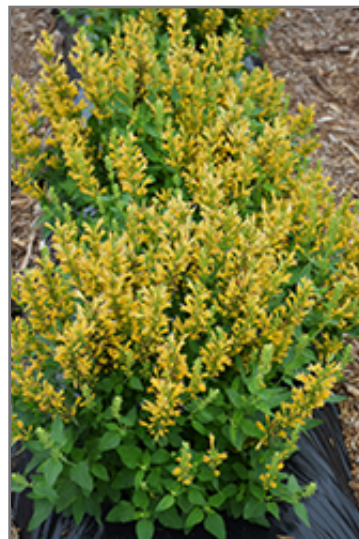
Poquito Butter Yellow Hyssop in bloom