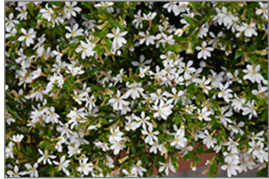
FloriGlory Maria Mexican Heather flowers

This is a multi-stemmed evergreen houseplant with an upright spreading habit of growth. Its relatively fine texture sets it apart from other indoor plants with less refined foliage. This plant may benefit from an occasional pruning to look its best.