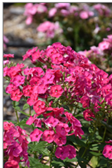
Ka-Pow Pink Garden Phlox flowers

Ka-Pow Pink Garden Phlox is recommended for the following landscape applications;