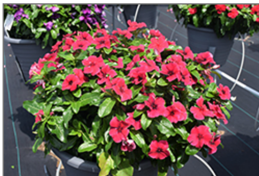
Tattoo Black Cherry Vinca in bloom

Tattoo Black Cherry Vinca is a fine choice for the garden, but it is also a good selection for planting in outdoor containers and hanging baskets. It is often used as a 'filler' in the 'spiller-thriller-filler' container combination, providing a mass of flowers against which the thriller plants stand out. Note that when growing plants in outdoor containers and baskets, they may require more frequent waterings than they would in the yard or garden.