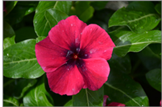
Tattoo Black Cherry Vinca flowers

This plant will require occasional maintenance and upkeep, and should not require much pruning, except when necessary, such as to remove dieback. It is a good choice for attracting butterflies to your yard, but is not particularly attractive to deer who tend to leave it alone in favor of tastier treats. It has no significant negative characteristics.