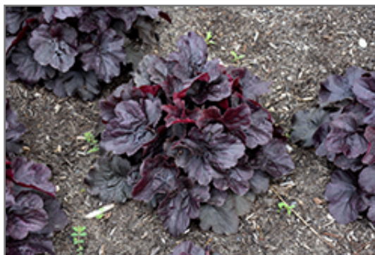
Northern Exposure Black Coral Bells