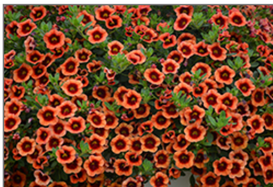
Superbells Tangerine Punch Calibrachoa flowers