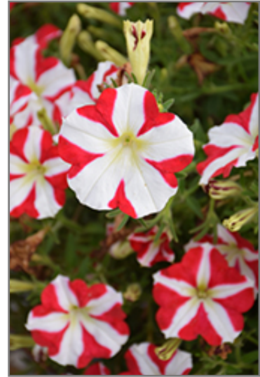
Amore King of Hearts Petunia flowers

Amore King of Hearts Petunia is recommended for the following landscape applications;