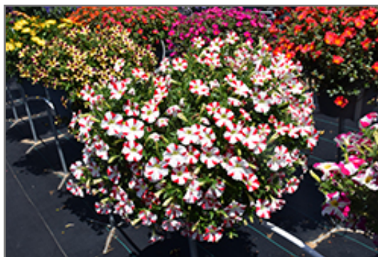
Amore King of Hearts Petunia in bloom

Amore King of Hearts Petunia will grow to be about 12 inches tall at maturity, with a spread of 14 inches. When grown in masses or used as a bedding plant, individual plants should be spaced approximately 10 inches apart. Its foliage tends to remain dense right to the ground, not requiring facer plants in front. This fast-growing annual will normally live for one full growing season, needing replacement the following year.