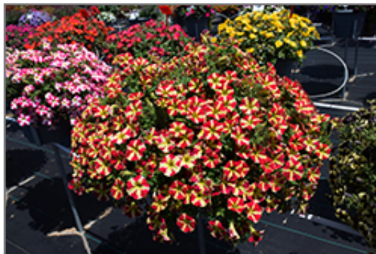
Amore Queen of Hearts Petunia in bloom

Amore Queen of Hearts Petunia will grow to be about 12 inches tall at maturity, with a spread of 14 inches. When grown in masses or used as a bedding plant, individual plants should be spaced approximately 10 inches apart. Its foliage tends to remain dense right to the ground, not requiring facer plants in front. This fast-growing annual will normally live for one full growing season, needing replacement the following year.