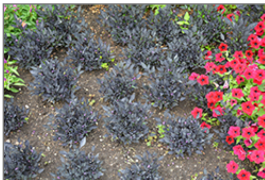
Onyx Red Ornamental Pepper

This plant will require occasional maintenance and upkeep, and should not require much pruning, except when necessary, such as to remove dieback. It is a good choice for attracting bees and butterflies to your yard, but is not particularly attractive to deer who tend to leave it alone in favor of tastier treats. It has no significant negative characteristics.