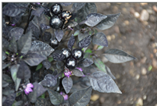
Onyx Red Ornamental Pepper fruit