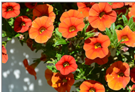
Colibri Orange Calibrachoa flowers

Colibri Orange Calibrachoa is recommended for the following landscape applications;