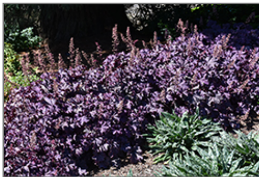
Grande Amethyst Coral Bells in bloom