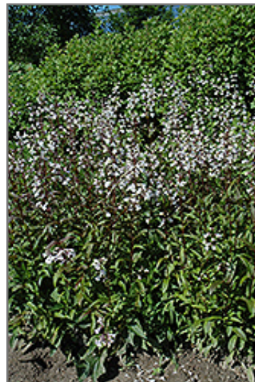
Husker Red Beard Tongue in bloom

This plant does best in full sun to partial shade. It prefers dry to average moisture levels with very well-drained soil, and will often die in standing water. It is considered to be drought-tolerant, and thus makes an ideal choice for a low-water garden or xeriscape application. It is not particular as to soil type or pH. It is somewhat tolerant of urban pollution. This is a selection of a native North American species. It can be propagated by cuttings; however, as a cultivated variety, be aware that it may be subject to certain restrictions or prohibitions on propagation.