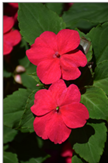
Imara XDR Rose Impatiens flowers

Imara XDR Rose Impatiens is recommended for the following landscape applications;