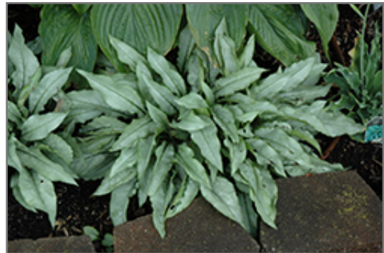
Majeste Lungwort