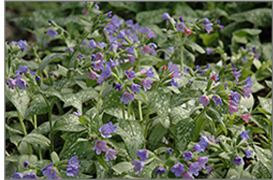
Majeste Lungwort flowers