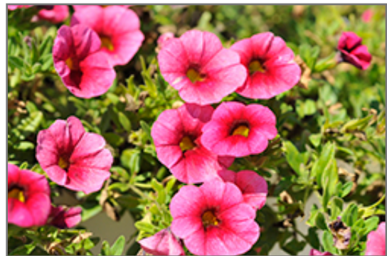
Colibri Malibu Pink Calibrachoa flowers