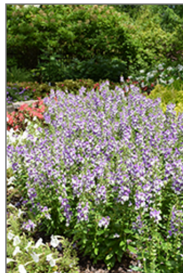
Alonia Big Bicolor Purple Angelonia in bloom

Alonia Big Bicolor Purple Angelonia is a fine choice for the garden, but it is also a good selection for planting in outdoor containers and hanging baskets. With its upright habit of growth, it is best suited for use as a 'thriller' in the 'spiller-thriller-filler' container combination; plant it near the center of the pot, surrounded by smaller plants and those that spill over the edges. Note that when growing plants in outdoor containers and baskets, they may require more frequent waterings than they would in the yard or garden.