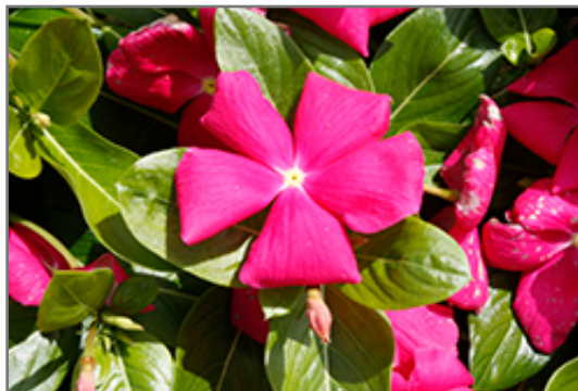
Cora Cascade Bright Rose Vinca flowers

Cora Cascade Bright Rose Vinca is recommended for the following landscape applications;