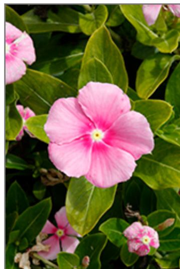
Cora Cascade Shell Pink Vinca flowers

Cora Cascade Shell Pink Vinca is recommended for the following landscape applications;