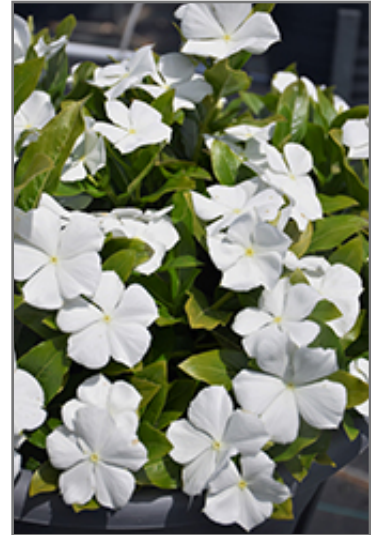
Cora Cascade White Vinca flowers

Cora Cascade White Vinca is recommended for the following landscape applications;