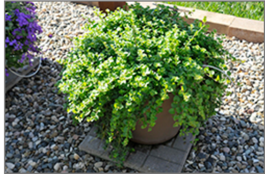
Indian Mint