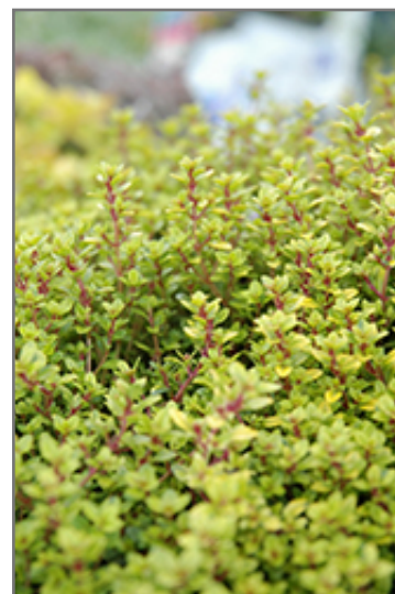
Archer's Gold Thyme flowers