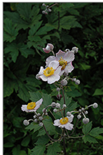
Grapeleaf Anemone flowers

Grapeleaf Anemone is recommended for the following landscape applications;