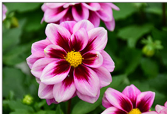
Dahlinova Florida Dahlia flowers