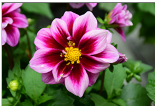
Dahlinova Florida Dahlia flowers