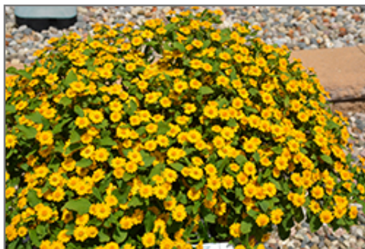
Jackpot Gold Melampodium in bloom

Jackpot Gold Melampodium will grow to be about 8 inches tall at maturity, with a spread of 15 inches. When grown in masses or used as a bedding plant, individual plants should be spaced approximately 12 inches apart. Its foliage tends to remain low and dense right to the ground. This fast-growing annual will normally live for one full growing season, needing replacement the following year.