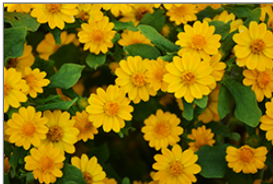
Jackpot Gold Melampodium flowers

Jackpot Gold Melampodium is recommended for the following landscape applications;