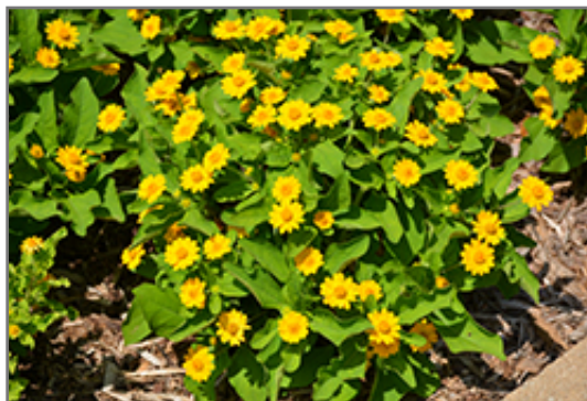
Jackpot Gold Melampodium in bloom