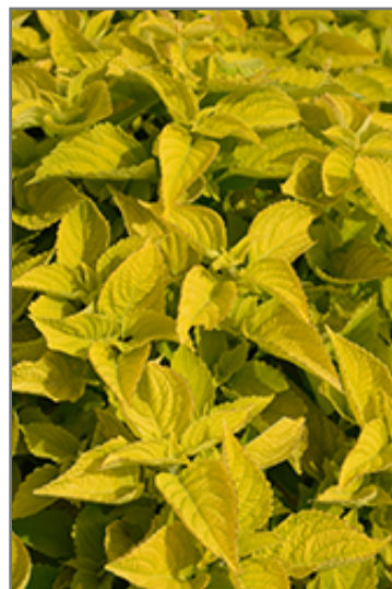
Chartres Street Coleus foliage

Chartres Street Coleus is recommended for the following landscape applications;