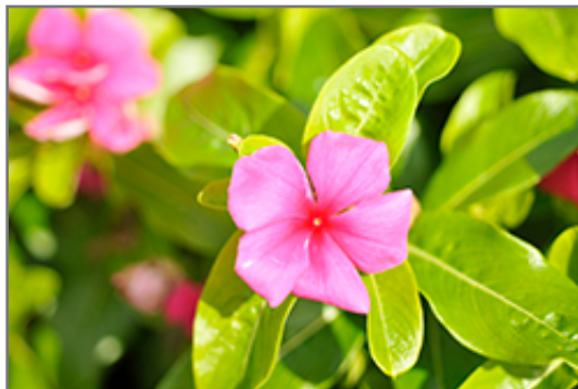
Pacifica XP Punch Vinca flowers

This plant will require occasional maintenance and upkeep, and should not require much pruning, except when necessary, such as to remove dieback. It is a good choice for attracting butterflies to your yard, but is not particularly attractive to deer who tend to leave it alone in favor of tastier treats. It has no significant negative characteristics.