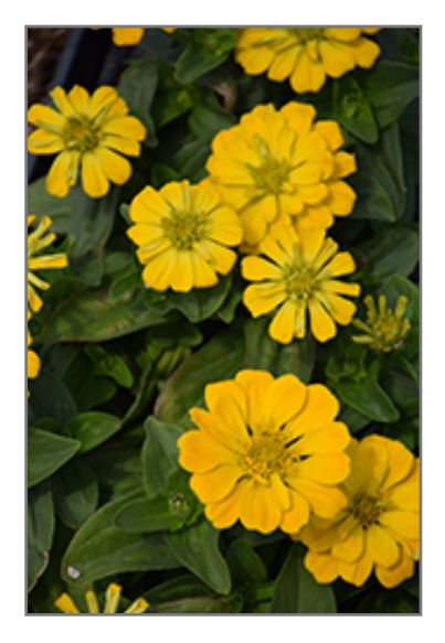
Magellan Yellow Zinnia flowers