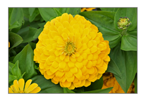
Magellan Yellow Zinnia flowers

Magellan Yellow Zinnia is recommended for the following landscape applications;