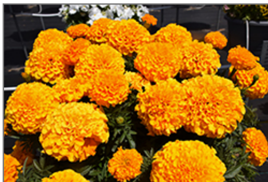
Antigua Orange Marigold flowers

Antigua Orange Marigold is recommended for the following landscape applications;