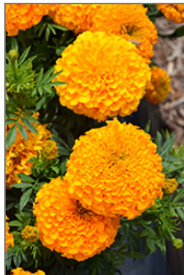
Antigua Orange Marigold flowers