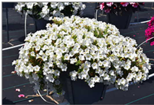
Itsy White Petunia in bloom