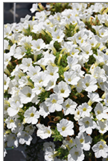
Itsy White Petunia flowers

This plant will require occasional maintenance and upkeep. Trim off the flower heads after they fade and die to encourage more blooms late into the season. It is a good choice for attracting bees, butterflies and hummingbirds to your yard, but is not particularly attractive to deer who tend to leave it alone in favor of tastier treats. It has no significant negative characteristics.