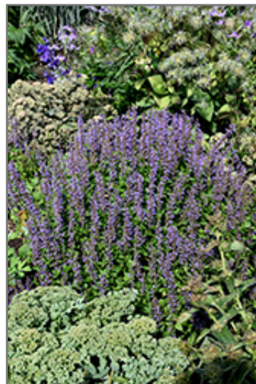
Blue Bayou Anise Hyssop in bloom