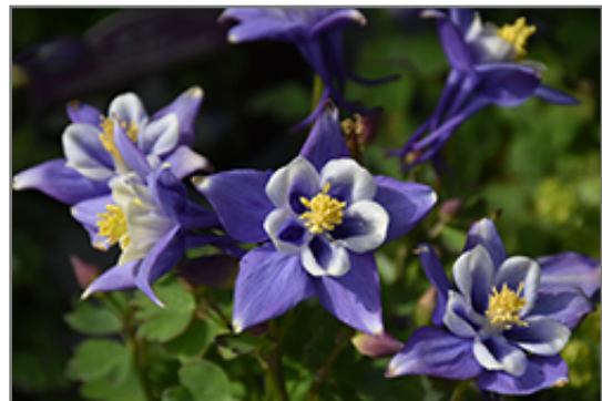
Earlybird Blue and White Columbine flowers