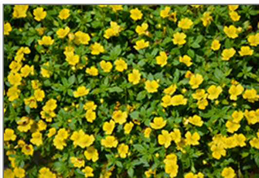
Garden Freckles Mecardonia flowers