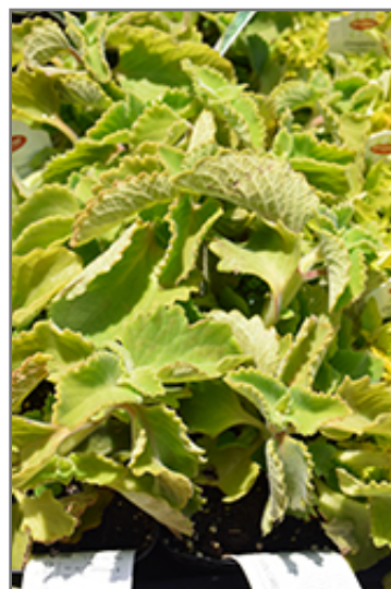
Mexican Mint foliage