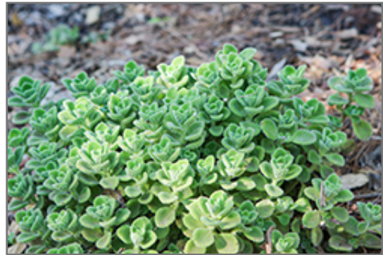
Mexican Mint