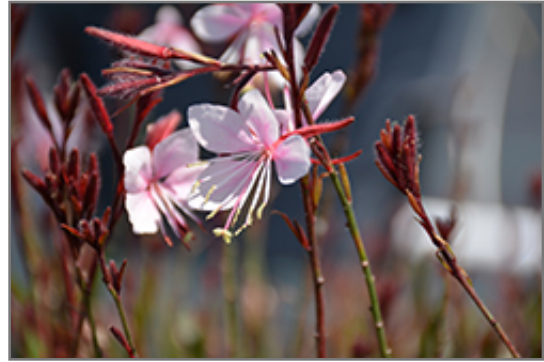
Steffi Blush Pink Gaura flowers

This is a relatively low maintenance plant, and is best cleaned up in early spring before it resumes active growth for the season. It is a good choice for attracting bees and butterflies to your yard, but is not particularly attractive to deer who tend to leave it alone in favor of tastier treats. It has no significant negative characteristics.