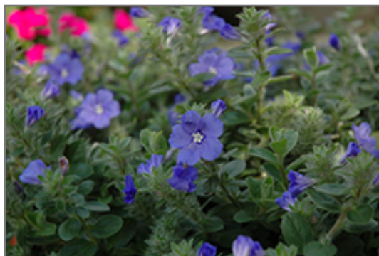
Blue Daze Dwarf Morning Glory flowers