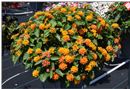
Gem Citrine Lantana in bloom