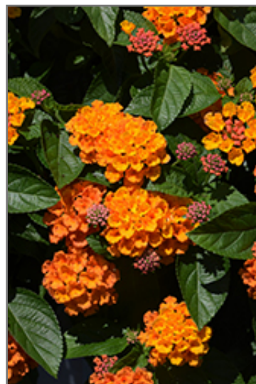
Gem Citrine Lantana flowers

Gem Citrine Lantana is recommended for the following landscape applications;