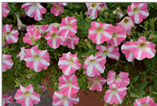
Amore Princess Petunia flowers