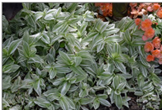
Pistachio White Spiderwort foliage

When grown indoors, Pistachio White Spiderwort can be expected to grow to be about 10 inches tall at maturity, with a spread of 3 feet. It grows at a fast rate, and under ideal conditions can be expected to live for approximately 10 years. This houseplant performs well in both bright or indirect sunlight and strong artificial light, and can therefore be situated in almost any well-lit room or location. It requires an evenly moist well-drained soil for optimal growth. The surface of the soil shouldn't be allowed to dry out completely, and so you should expect to water this plant once and possibly even twice each week. Be aware that your particular watering schedule may vary depending on its location in the room, the pot size, plant size and other conditions; if in doubt, ask one of our experts in the store for advice. It will benefit from a regular feeding with a general-purpose fertilizer with every second or third watering. It is not particular as to soil type or pH; an average potting soil should work just fine.