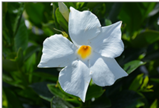
Bella White Mandevilla flowers

Bella White Mandevilla is a fine choice for the garden, but it is also a good selection for planting in outdoor pots and containers. Because of its spreading habit of growth, it is ideally suited for use as a 'spiller' in the 'spiller-thriller-filler' container combination; plant it near the edges where it can spill gracefully over the pot. It is even sizeable enough that it can be grown alone in a suitable container. Note that when growing plants in outdoor containers and baskets, they may require more frequent waterings than they would in the yard or garden.