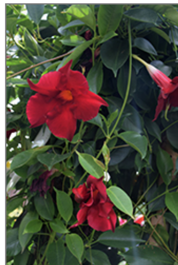
Madinia Maximo Red Mandevilla flowers

Velvety, elegant red flowers appear on this vigorous, naturally compact selection with a shrubby growth habit; blooms from spring through summer; deep green foliage serves as the perfect contrast; great for arbors, garden walls, containers or baskets