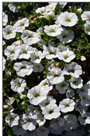
Colibri Pure White Calibrachoa flowers