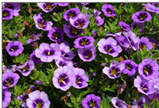
Colibri Spark Purple Calibrachoa flowers

Colibri Spark Purple Calibrachoa is recommended for the following landscape applications;