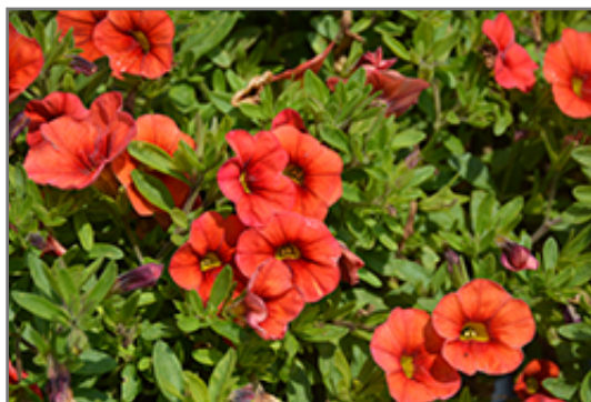
Colibri Tangerine Calibrachoa flowers

Colibri Tangerine Calibrachoa is recommended for the following landscape applications;